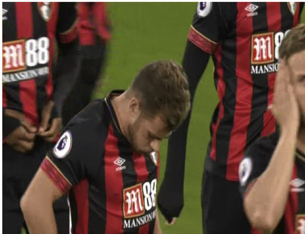
Fig. 1. Example of football shirt sponsorship.

(West Ham United vs Manchester United, 667; Bournemouth vs Crystal Palace, 974) and SPL (Rangers vs Celtic, 920), compared to the men's international friendly (England vs Italy, 9) and UEFA Champions League (Tottenham Hotspur vs Barcelona, 25). This influenced frequency, with gambling marketing references appearing more frequently in the SPL (Rangers vs Celtic, 6.18 times per minute) and EPL (Bournemouth vs Crystal Palace, 4.01 per minute; West Ham vs Manchester United, 3.95 per minute), compared to the UEFA Champions League (Tottenham vs Barcelona, 0.11 per minute) and international friendly (England vs Italy, 0.05 per minute). Broadcasts that featured two teams sponsored by gambling brands each featured over 900 references per broadcast