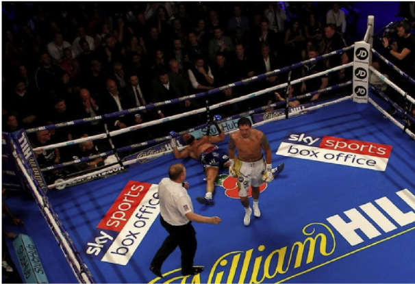
Fig. 2. Example of boxing sponsorship.

gambling marketing references in this broadcast were commercial advertisements, which may have been due to the broadcast being a highlights programme.